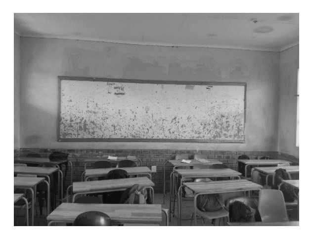
Figure 1 Photos of the chalkboard at the front of the classroom and the bulletin board at the back of the classroom. All walls are barren.