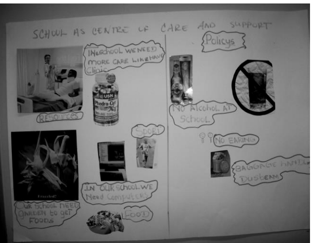
Figures 2–5 The four collages created by the participants